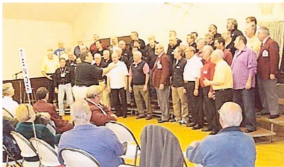
Mized Chorus - New York, New York