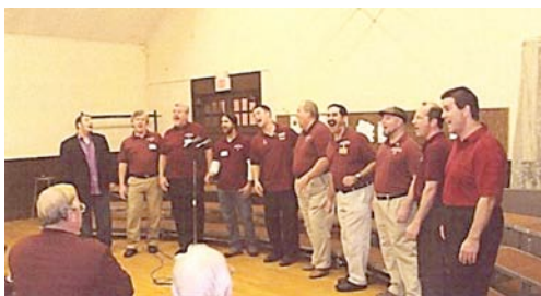
Five Town College Chorus