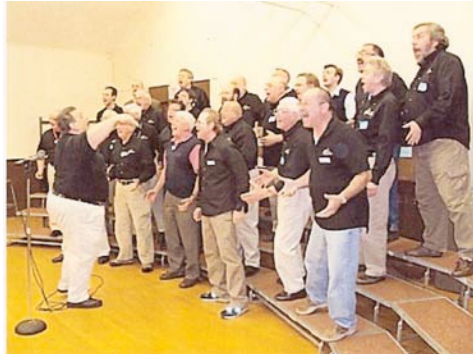
Big Apple Chorus