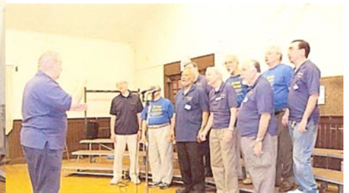
Kings Chorus/The Queensmen