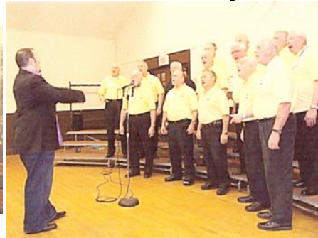
Western Suffolk Twin Shores Chorus