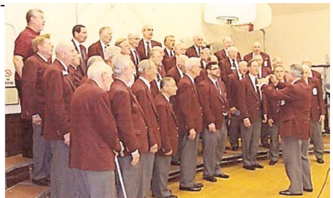
The Long Island Harmonizers Chorus

More photos on page 8