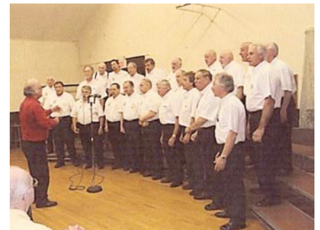
North Brookhaven's Harbormen