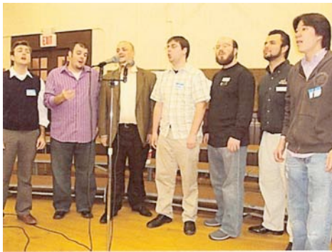
Voices of Gotham