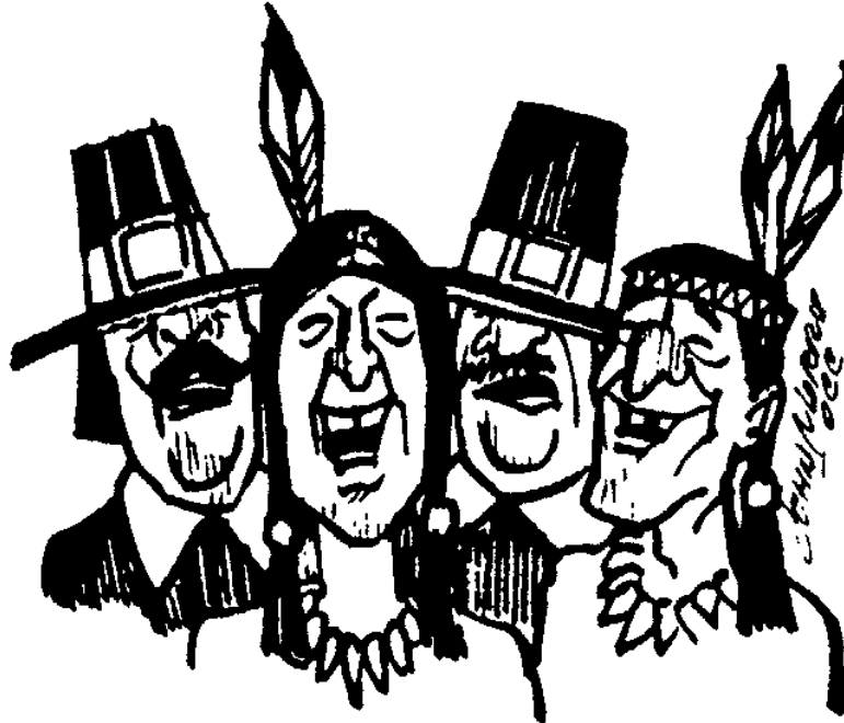
AMERICA’S EARLIEST BARBERSHOP QUARTET (circa 17 th century)

“We gather together to ask the Lord’s blessing.”